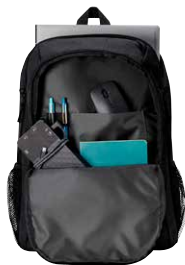
HP Prelude Pro Recycled Backpack