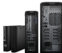
OPTIPLEX CABLE COVERS

Experience exceptional audio clarity with this Teams certified wired headset that allows you to wear the microphone on either side for a customized fit.