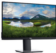
DELL 24 MONITOR - P2421D

Optimize your workspace with this efficient 23.8" monitor built with an ultrathin bezel, a small footprint and comfort-enhancing features.