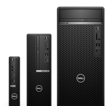
OPTIPLEX DUST FILTERS

Thermally tested custom cable covers offer an easy to install and attractive way to manage cables and secure ports.