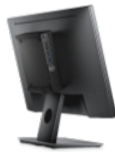
OPTIPLEX MICRO ALL-IN-ONE MOUNT FOR DELL E SERIES MONITORS

Maximize your desk space with this sleek arm that supports both system and monitor mounting.