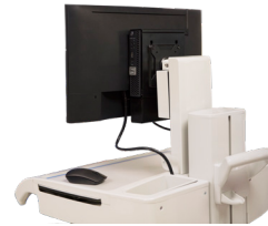
OPTIPLEX MICRO DUAL VESA MOUNT WITH ADAPTER BRACKET

This mount allows the Micro to be VESA mounted to select Dell E Series displays.