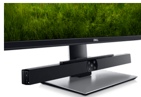
DELL PROFESSIONAL SOUND BAR - AE515M

Optimize your workspace with this efficient 23.8" monitor built with an ultrathin bezel, a small footprint and comfort-enhancing features.