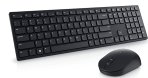
DELL PRO WIRELESS KEYBOARD AND MOUSE - KM5221W

Optimize conference calls and multimedia streaming with exceptional audio clarity. Minimize background noise while on calls with the dual mic array and echo cancellation feature.