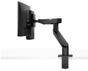
DELL SINGLE MONITOR ARM - MSA20

Maximize your desk space with this sleek arm that supports both system and monitor mounting.