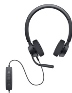
DELL PRO WIRED HEADSET - WH3022 (COMING SOON)

Wired mouse with fingerprint reader offers convenient and secure login and online access without passwords.